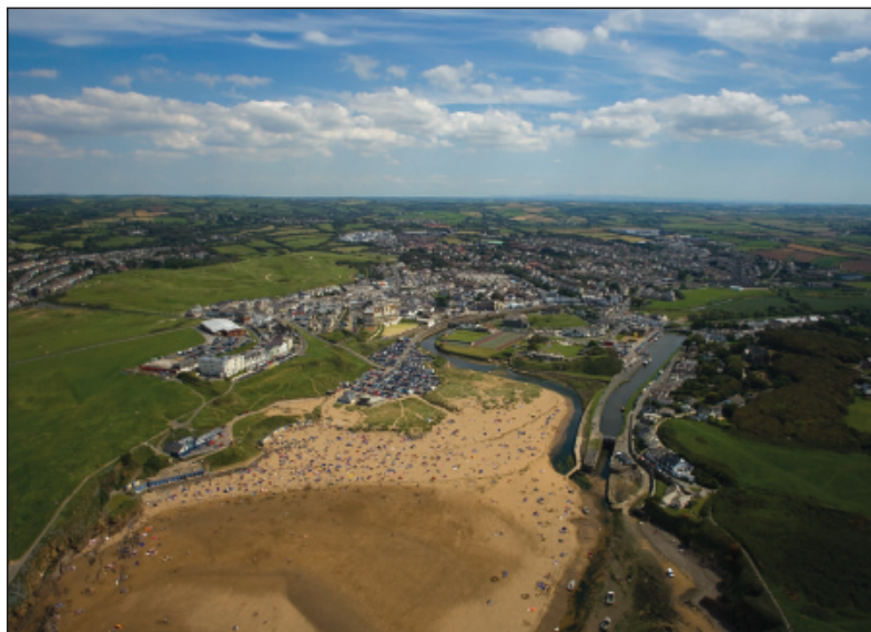
Looking south-east into Bude.