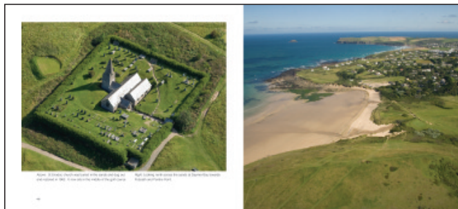
Example of a double page spread.