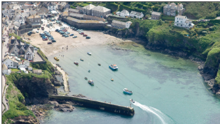
The protecting arms of the harbour wall at Port Isaac.