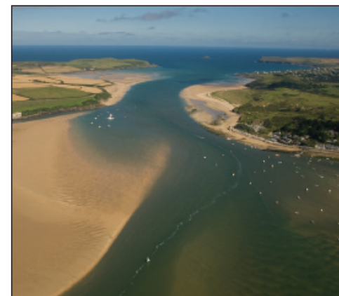
The River Camel winds its way to the sea.